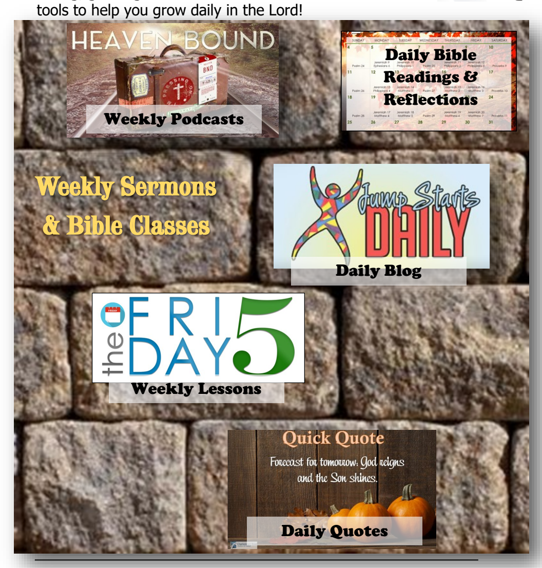
Charlestown Rd Plans for 2021

The arsenal of available material from this congregation is extensive, massive and easy to find, share and use. Our website (www.Charlestownroad.org) is the main hub. From there you can access all of these resources and a wealth of classes, sermons, videos, podcasts, blogs that are archived from the past. This congregation also has active links on Facebook & Twitter. Every single day you can find the tools to build a strong, growing and active faith in the Lord! Use these