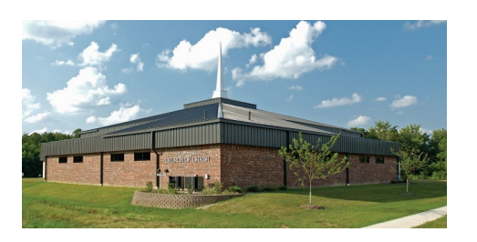
Charlestown Road church of Christ 4601 Charlestown Road New Albany, IN 47150