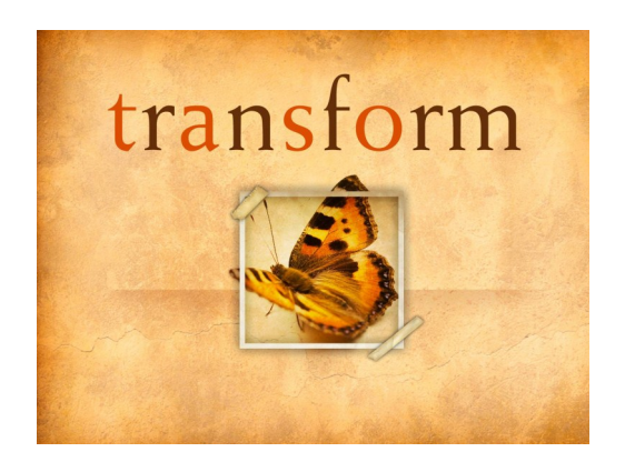
Discernment · Adoption Renewal · Engagement 2011